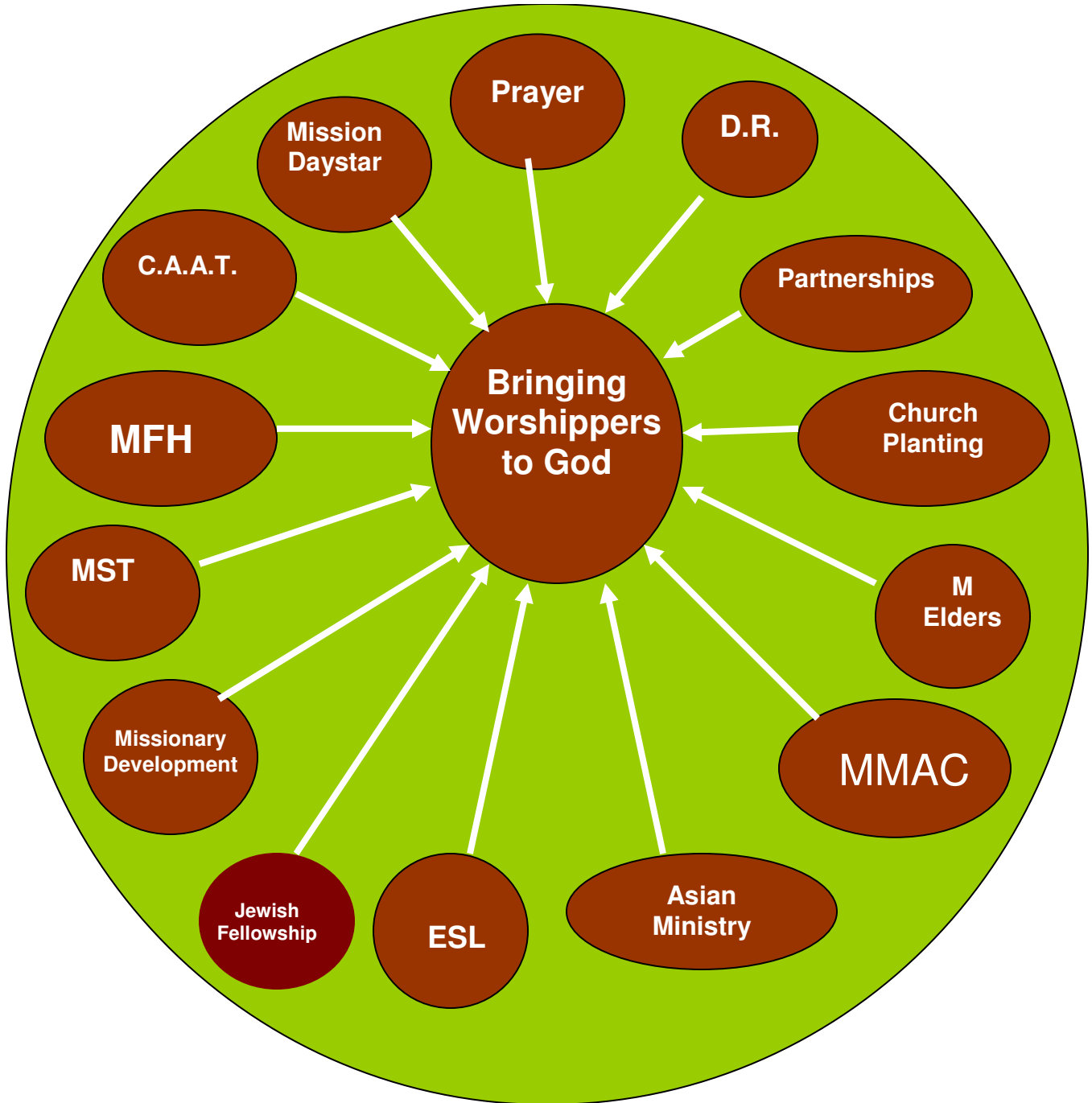
Diagram drawing depicting LBC mission structures

We choose to illustrate our structure through the diagram above because it reveals our desire to create a missions team that works together to reach the lost. No one person or team is more important than any other. All the different ministries have their own primary focus, but they interact with each other whenever possible in order to further the spread of the gospel. The green background represents the covering of prayer and fasting as we seek the Lord to discern His will. We need to clarify that having teams does not mean we reach a consensus on everything or have a lack of leadership by the